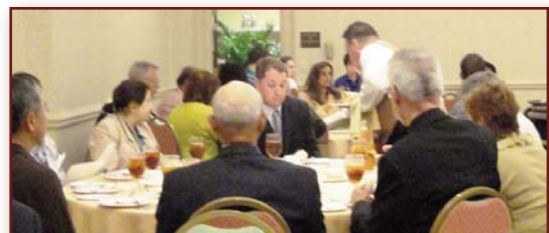
At the General Assembly