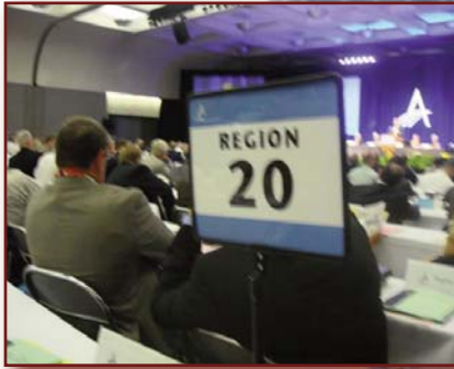
Region 20 Delegation at AGD House of Delegates meeting