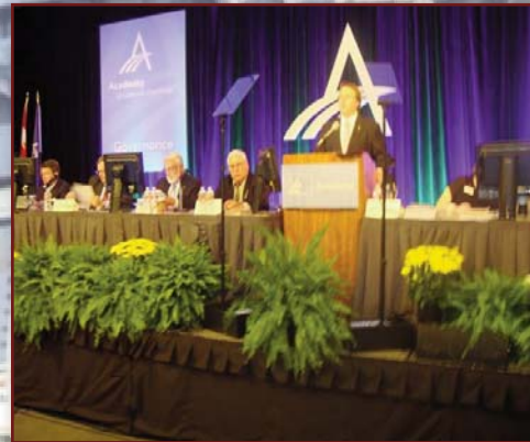
Podium, AGD House of Delegates Meeting